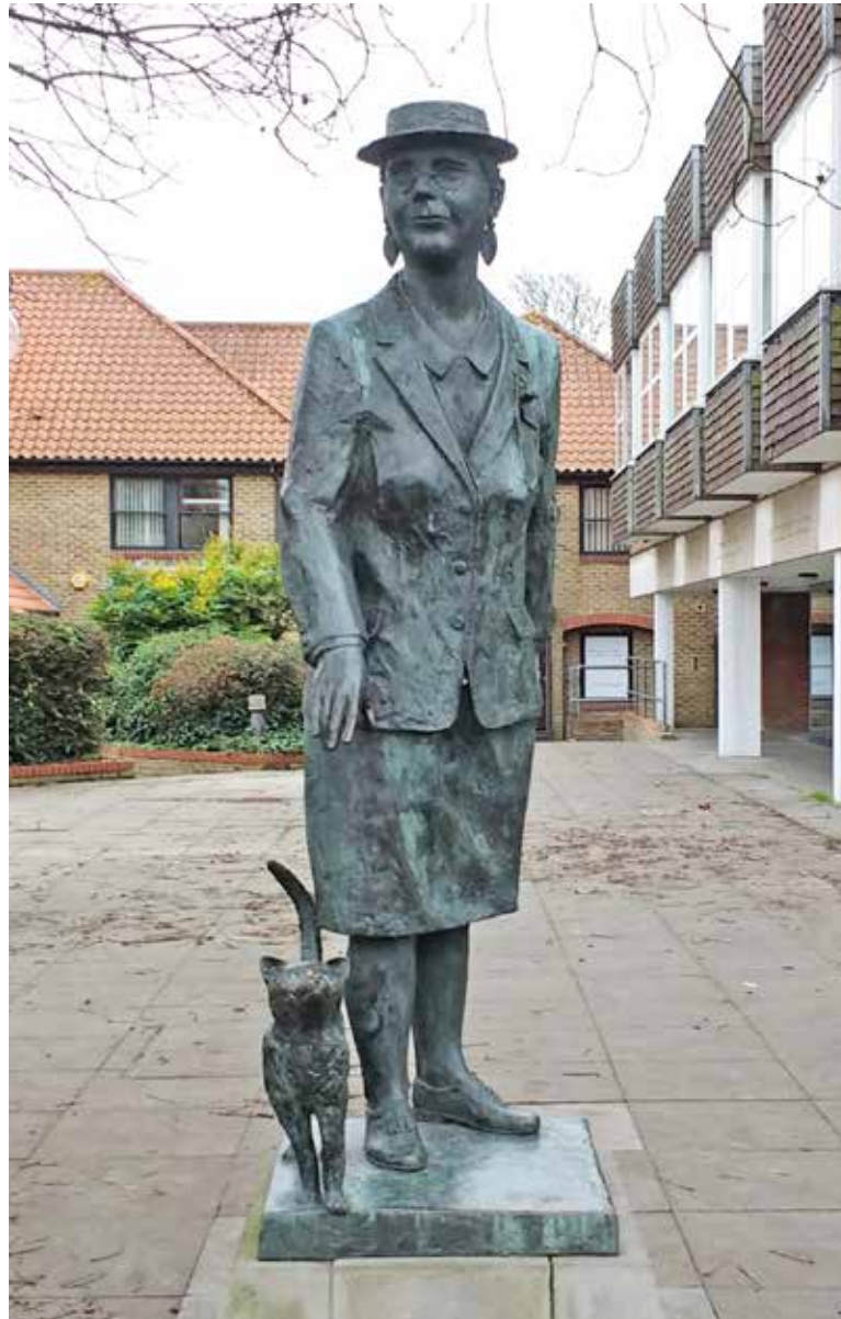
Statue of Dorothy L. Sayers opposite her former home in Witham, Essex.

Sayers's reward, however, was the positive responses, and those were overwhelming. One man wrote, "I learnt more about my religion in half an hour today than I ever did in the years of Sunday School." Another said, "I have known this story my whole life, but you have made it come alive in a totally new way." Sometimes the effects were immediately and profoundly practical: "Your play The Man Born to be King is quite changing the atmosphere in