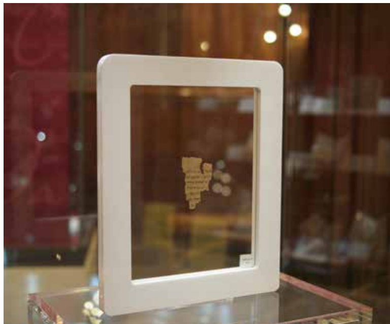
Rylands Greek P 457, also known as The St John Fragment, on display in the Rylands Gallery at John Rylands Library in Manchester, England

As followers of Jesus, we are called to keep alive the truth that Jesus lived and testified to Pilate, the truth that God is real and that God is faithful with love for all God's creation and all God's people.