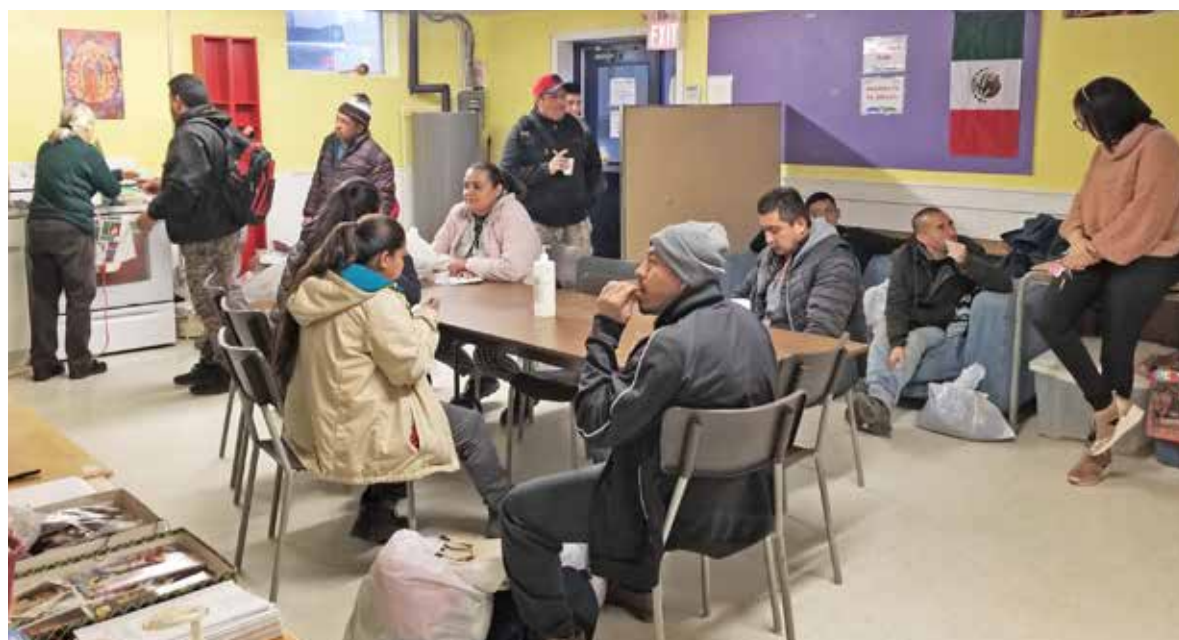
The lounge space has become a favourite gathering place.