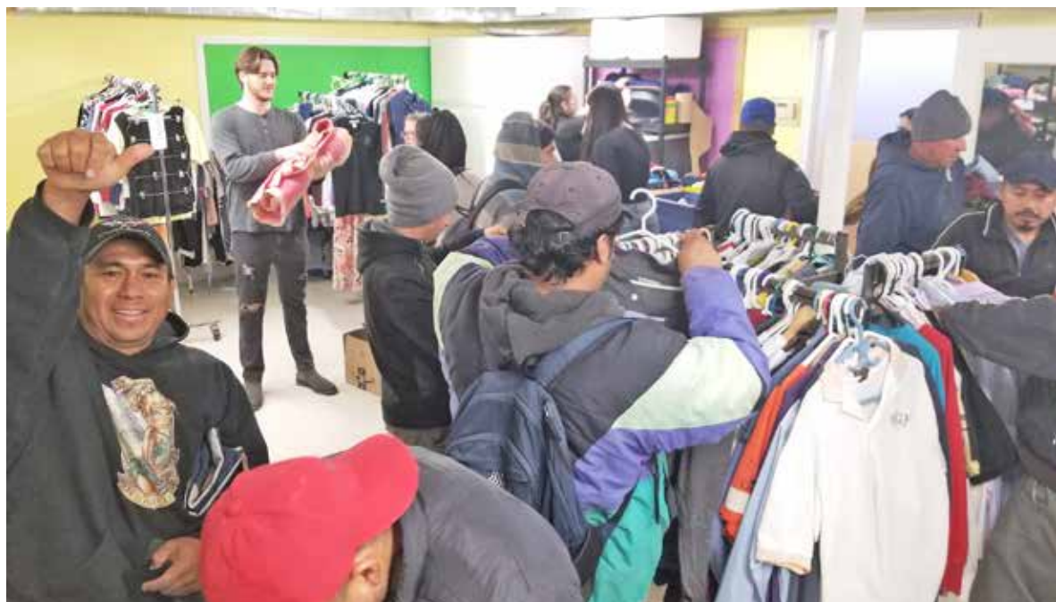
The Migrant Farmworkers Hub at St. Alban's Beamsville gets a big thumbs up!