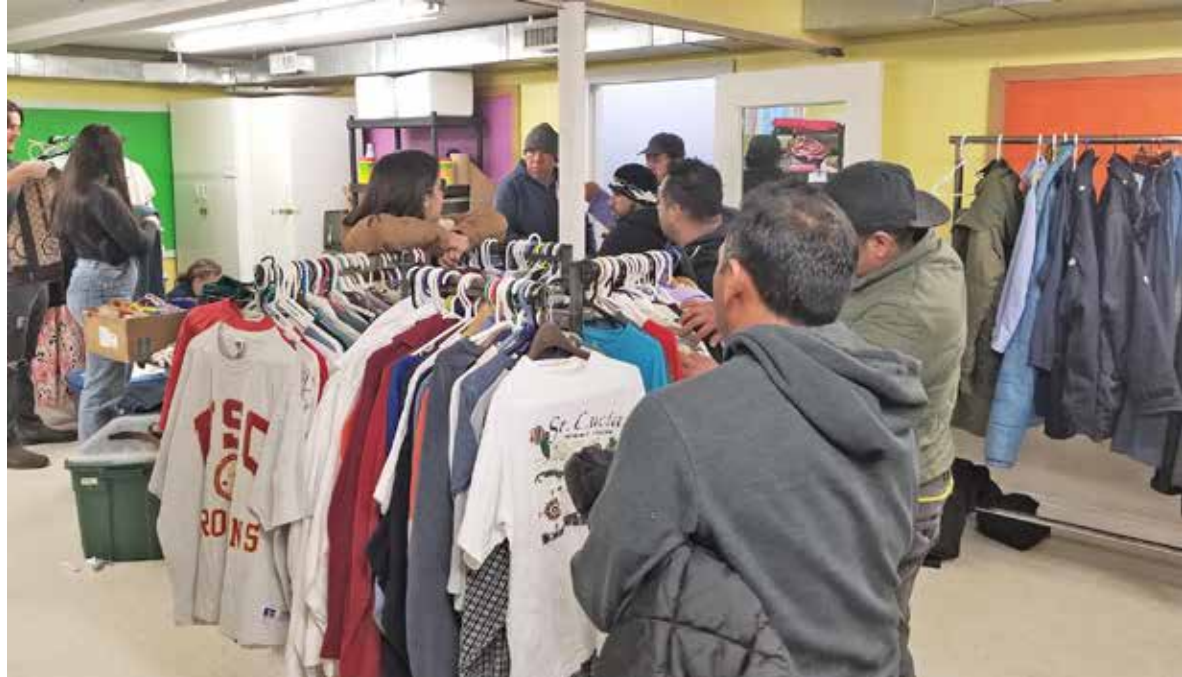
Workers look through clothing items.