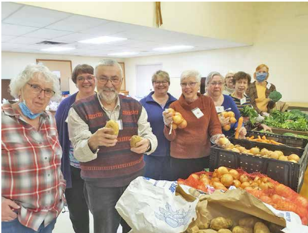
Volunteers ready to assist clients with fresh vegetables. Fresh fruits and dry goods are hidden by the volunteers!

We keep our list of nonperishable items small so as to have enough for each family. That's at least 60 jars of peanut butter, or boxes of cereal, etc. We also rotate through these items because they can weigh a lot along with the fresh produce. Our "most wanted" items are: Breakfast cereal, peanut butter, pasta and pasta sauce, canned