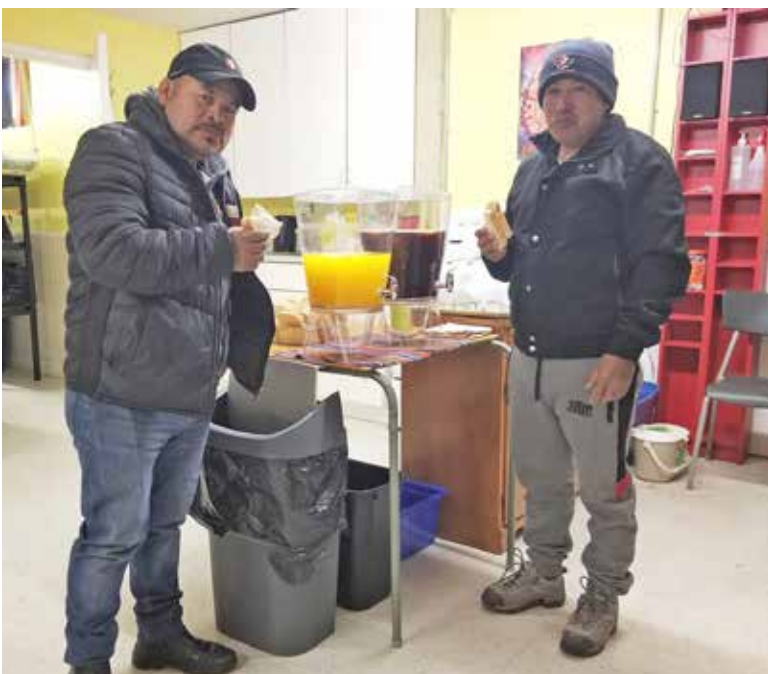
Workers often gather together over food and beverages at the Hub at St. Alban's Beamsville.