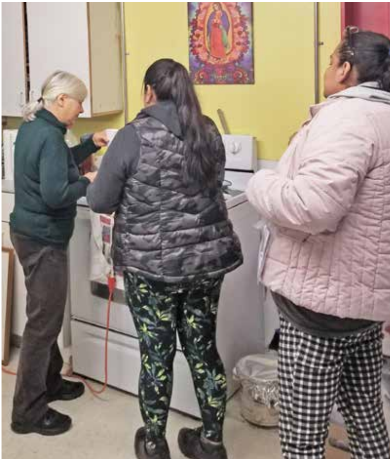
A kitchen space is available to workers.