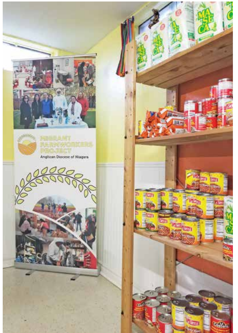
Some of the items available at the food pantry at the Hub at St. Alban's Beamsville.

In April 2022, the St. Alban's Hub Beamsville started weekly social justice services and outreach. Under one roof the seasonal workers can benefit from six different programs: Bikes for Farmworkers, Quest Healthcare Centre (partnership