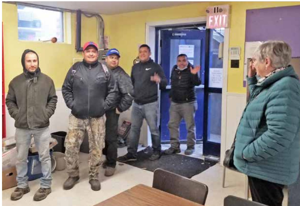
Workers are welcomed to the Hub at St. Alban's Beamsville.