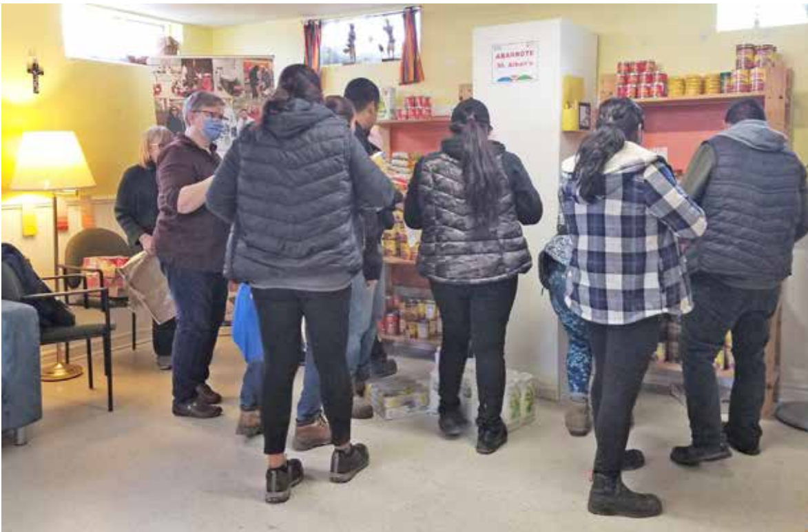
The pantry provides traditional culinary staples for workers.