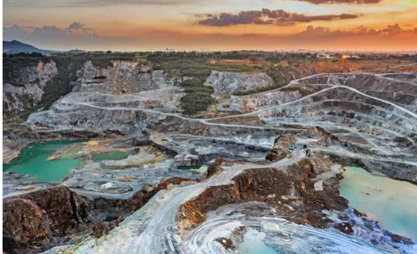
The anthropocene has been coined to refer to the current geological epoch, marked by the permanent changes human activity has made to the earth and its ecosystems.