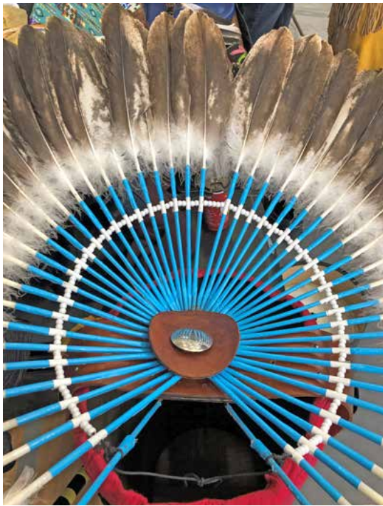
Dance outfits at the powwow are colourful and inspiring.