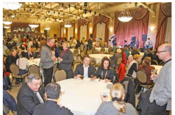
(Below) Following the seating worship, people relaxed and enjoyed the reception and the music of the NYC band.