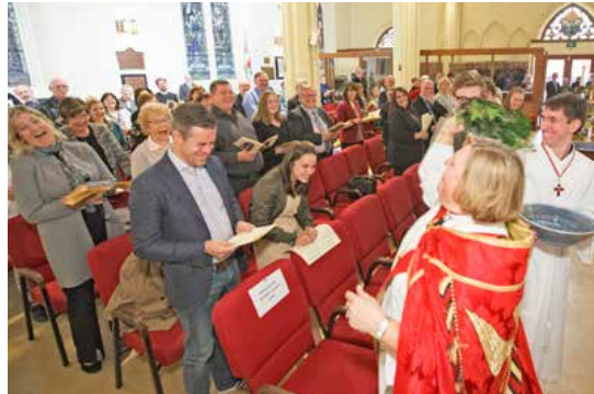
(Right) Following the renewing of their baptismal covenant, Bishop Susan, with great glee, sprinkles the congregation with water from the font as a tangible reminder of their baptism.