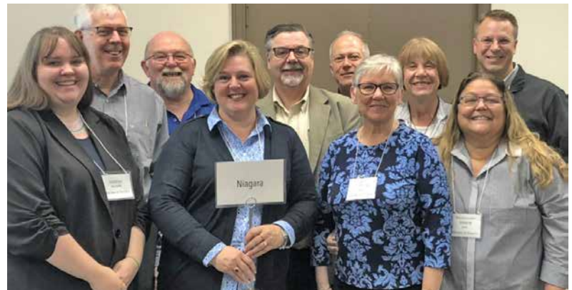
Niagara Diocese was well represented at the Provincial Synod, sending the Bishop, Chancellor, lay and clergy delegates.

on Niagara with a slight raise in our diocesan assessment.