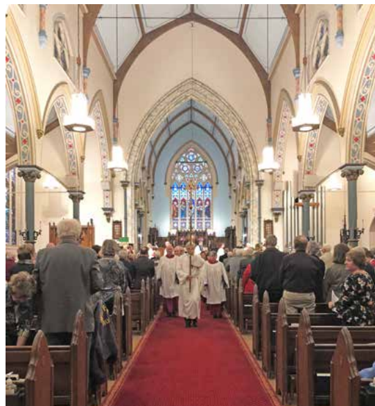
Two hundred people crowded in St. George's Guelph for a choral Evensong to mark, with thanksgiving, the 70th anniversary of Chi Rho Fellowship in that parish.

Later the celebration continued as the Chi Rho fellowship enjoyed their 70th anniversary dinner, filled with memories of special moments over the ages presented by several long-term members.