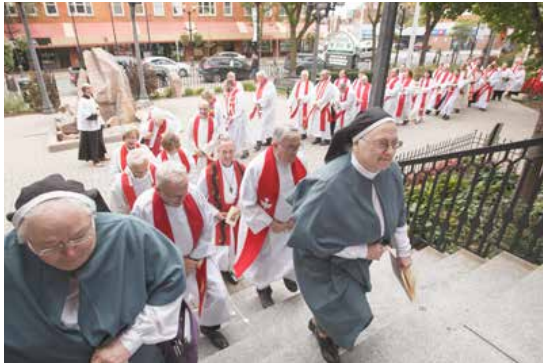
(Left) Clergy and dignitaries process into the Cathedral heralding the beginning of worship.