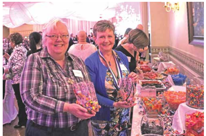
The candy table was a sweet gathering place to congregate and enjoy.