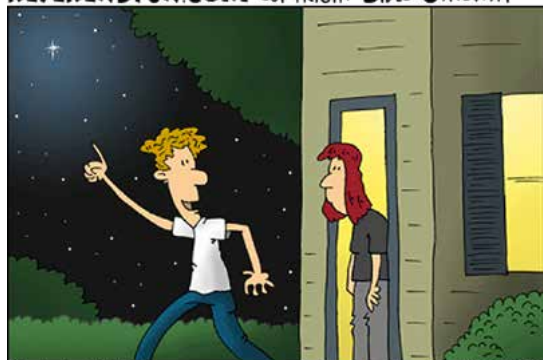
(See Luke 2:1-16)