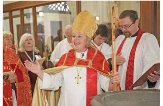
(Right) At the font, Bishop Susan led people through the renewing of their baptismal promises.