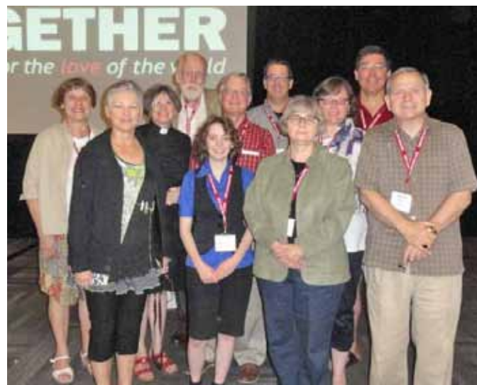
▲ Our representatives: Niagara Delegation to General Synod 2013

Individuals wishing details of the General Synod - Joint Assembly can read more in the summer issue of the Anglican Journal or the daily reports at www.anglicanjournal.com/archives or you can speak to one of Niagara's delegates.