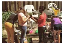
Volunteers at Micah House

Spiritual nurture underpinned the entire weekend—Friday night Compline, Saturday morning sending prayers, Saturday night Eucharist - culminating with Sunday morning worship with the Cathedral parish family, which included the NYC Band