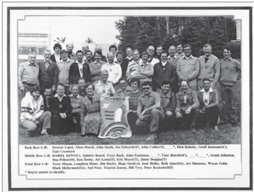
Participants attending the first Cursillo weekend at St. Mildred's-Lightbourn School Oakville, March 1983.