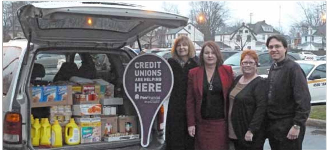
PenFinancial staff and Holy Trinity parishioners display a van load of donations for the food and hygiene pantry.

After consultation with different groups, including various Christian churches, we began to focus on a niche which wasn't being met in downtown Welland. What the niche was and what makes Holy Trinity unique is our hygiene contribution united with our food pantry.