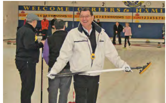
▶ Smiles, frowns and serious faces reflect the many moods of curling.