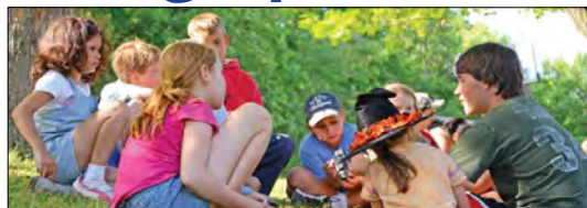
Children and leaders learn and share outdoors at Canterbury Camp

Coming up on our camp agenda is our new staff hiring event where we have the chance