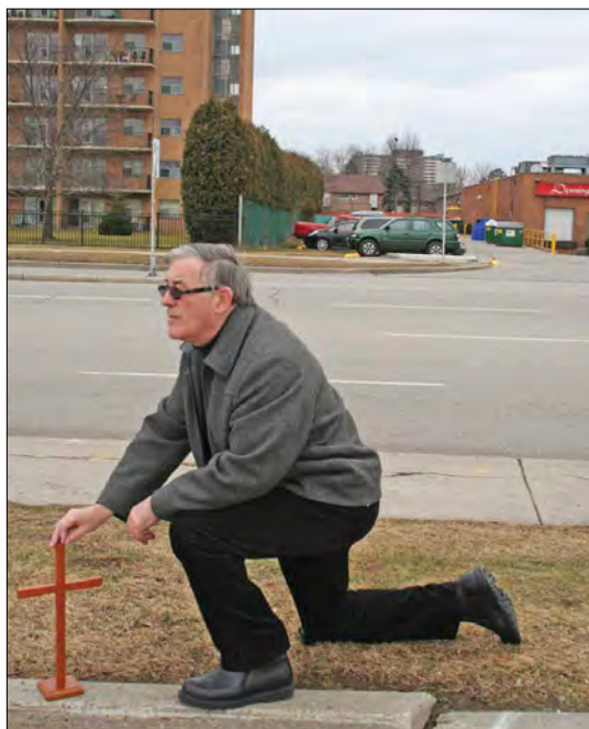
Next to a city street and in front of an apartment building the Niagara Anglican Editor is practicing his Tebowing prayer position.

So whether it is in a public field, or in a secluded corner or while strolling along well known or unfamiliar paths, prayer can still do more good than we can ask or imagine and produce more results than can be dreamed about.