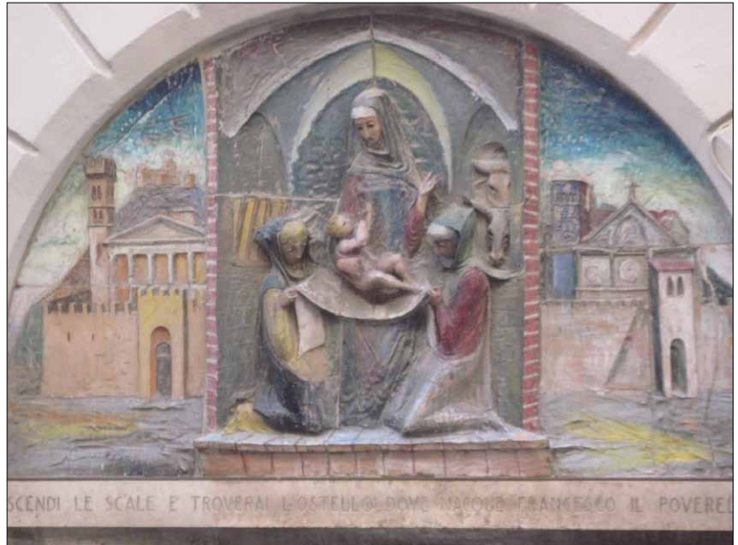
Nativity depiction in Assisi

While they were there, the time came for her to deliver her child. And she gave birth to her firstborn son and wrapped him in bands of cloth, and laid him in a manger, because there was no place for them in the inn. In that region there