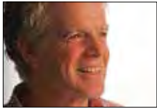
JEFF MAHONEY The Hamilton Spectator (Reprinted with permission)

Monologues of a different subject played at an Anglican Church near you