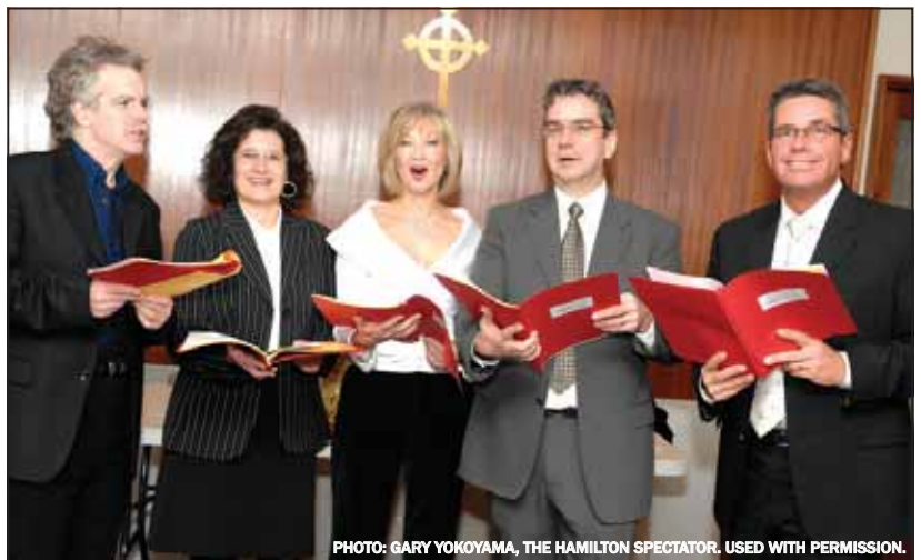
USED WITH PERMISSION.

Another Outreach surprise this year was the annual reading of Dicken's Christmas Carol by celebrity guests hosted by the parish. The reading itself was not the