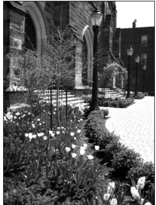
The garden at Christ's Church Cathedral welcomes parishioners, staff, and all those who pass by.

Moving to Formbly, on England's northwest coast, challenged Elizabeth's green thumb: "It was sand, nothing stood up! But vegetables did very well, especially the