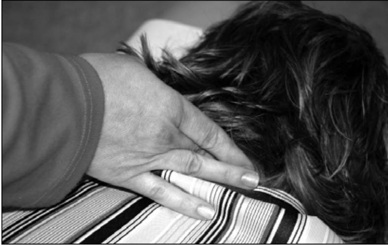
Chiropractic: Helping the body heal itself can be a spiritual exercise.