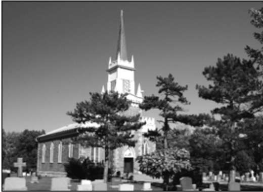
Holy Trinity, Chippawa