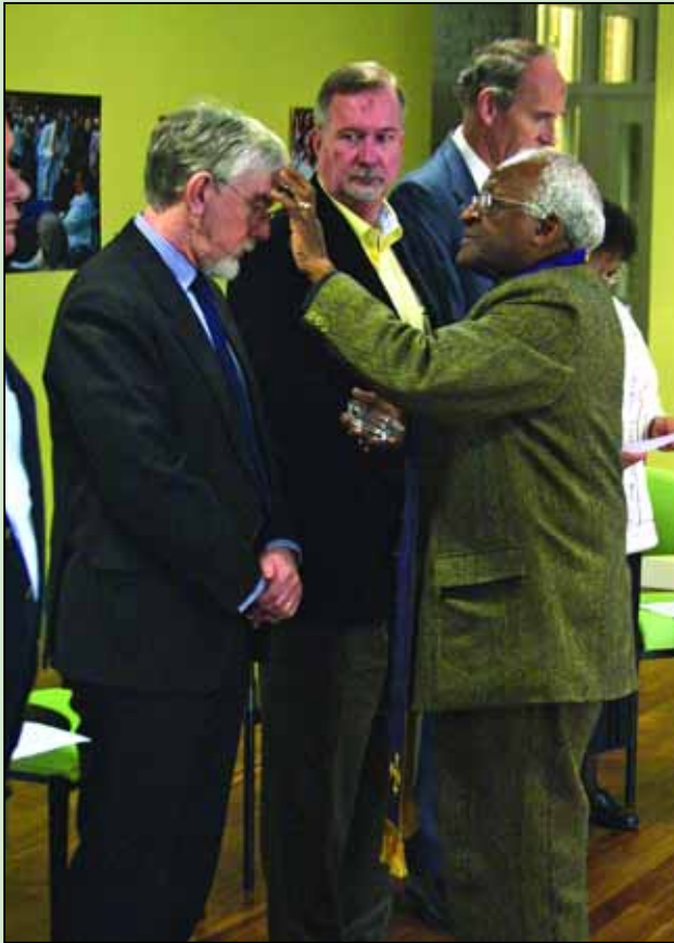
The imposition of ashes on Ash Wednesday, 2004, by Archbishop Tutu at a staff service in St. Andrews House, London, the office of the Anglican Communion.