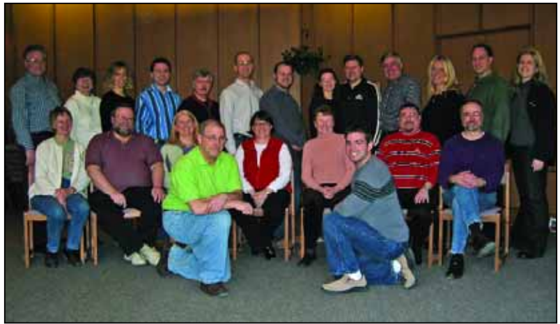
Theological students from across the diocese at their annual gathering at Canterbury Hills.