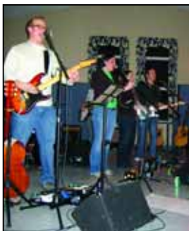
Members of the NYC band.